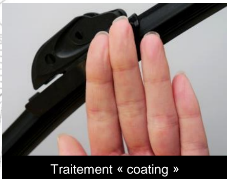
Traitement « coating »

Our wiper blades are manufactured from synthetic rubber. Unlike natural rubber, synthetic rubber is much longer lasting.